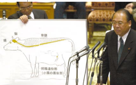
Grave disclosure: Japan's agriculture minister, Tsutomu Takebe, breaks the news.